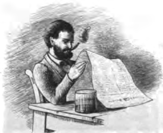
The young Philipp Scharwenka in a self-portrait

In 1881 Philipp and Xaver founded the Scharwenka Conservatoire in Berlin. In spite of the dominant position of the Kullak Academy, which boasted 100 teachers and 1,000 students in 1880, 8 the Scharwenkas' little school at Potsdamer Strasse 136-37 flourished, with Philipp providing daily guidance and Xaver's tours as a pianist adding much-needed publicity. After Xaver's first concert successes in North America in 1890, he and Philipp embarked from Bremen on 26 August of the same year on the Kaiser Wilhelm II bound for New York, with the goal of establishing a new conservatoire. 'The brothers Scharwenka, Xaver and Philipp [ sic ], will settle permanently in this city