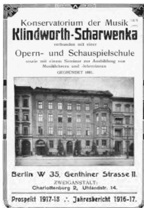
The Klindworth-Scharwenka Conservatoire after 1905